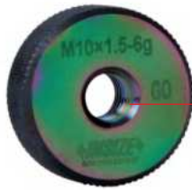
DLC coated GO ring gauge